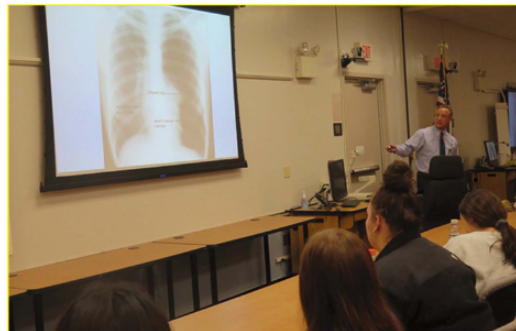
Figure 1. Didactic lectures include how to interpret imaging studies.

My ideas and concepts led to the development of a tipless kidney